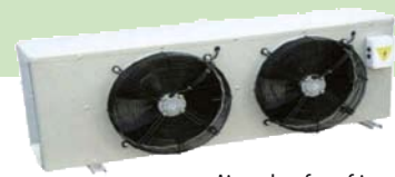
Air coolers for refrigeration