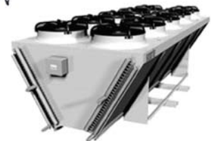
Air cooled condensers

The purpose of the Eurovent “Certify-All” certification programme for heat exchangers is to encourage honest competition and to assure customers that equipment is correctly rated.