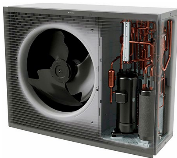
Open caption of a modern, improved heat pump.