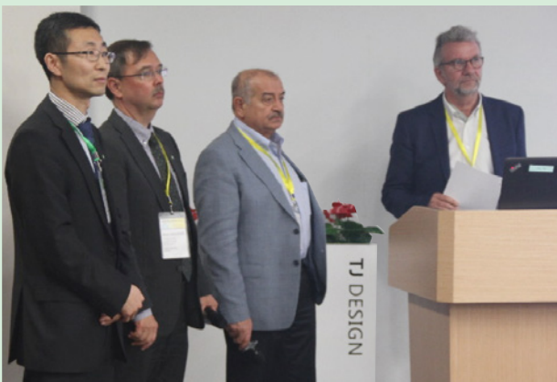
Photo 5. SCANVAC workshop: Advanced airflow distribution methods for reduction exposure to indoor pollution 27.10.2015.